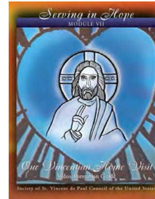
The Spirituality of the Home Visit